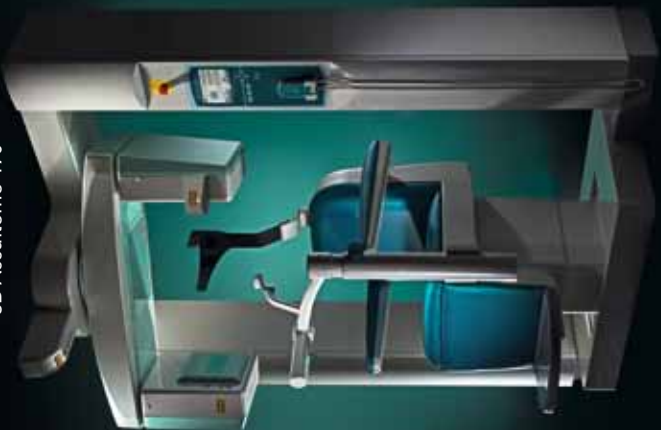
3D Accuitomo 170